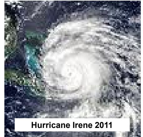
Hurricane Irene 2011

The canal embankments were damaged down to the Seven Stars Hotel. The Reading Company bridge in Schuylkill Haven was destroyed along with the Schuylkill Navigation Co.'s railroad bridge to Dundas Landing.